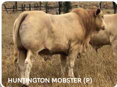
HUNTINGTON MOBSTER (P)