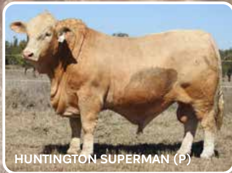
HUNTINGTON SUPERMAN (P)