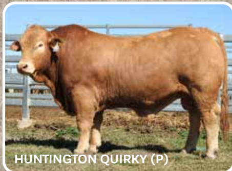
HUNTINGTON QUIRKY (P)