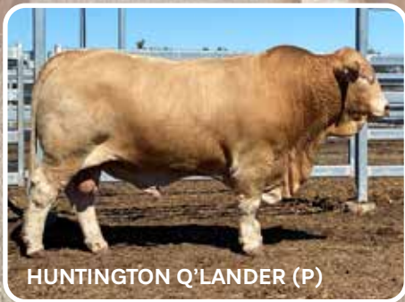
HUNTINGTON Q'LANDER (P)