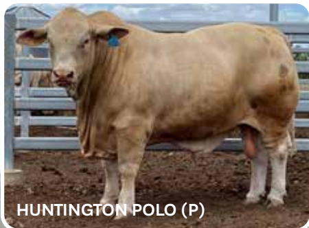
HUNTINGTON POLO (P)