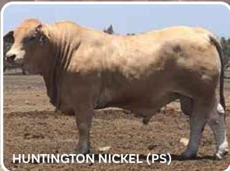
HUNTINGTON NICKEL (PS)