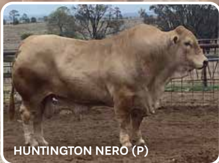
HUNTINGTON NERO (P)