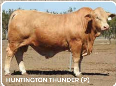
HUNTINGTON THUNDER (P)