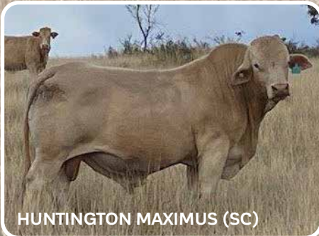
HUNTINGTON MAXIMUS (SC)