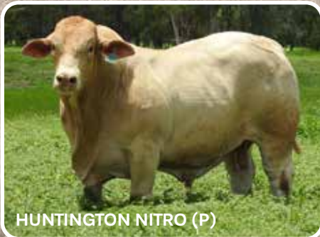
HUNTINGTON NITRO (P)